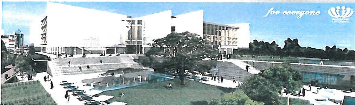
An artist's impression of the new Chatswood Civic Place

The project consists of a 400 car underground carpark , Public Library, Civic Hall, 500 seat Theatre, 1000 seat Concert Hall, Retail Shops ,Cafes & Restaurants